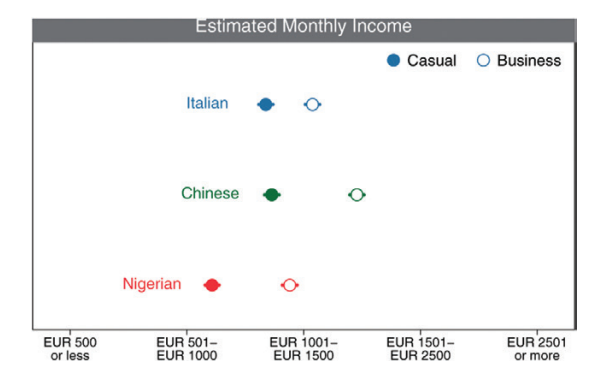
Figure 2. Income ratings, by confederates' race and attire. Note: The figure displays estimated income ratings across all six experimental conditions. Data are drawn from the 2019 survey. Africans in casual dress are rated as having lower income compared to casually-dressed Italians and Chinese. Irrespective of race, confederates in suits are rated as having higher income. See Supplementary Table S19 for analysis confirming the statistical significance of these patterns.

We employ an experimental manipulation to evaluate whether a likely basis for instrumental aversion—i.e. the association of Sub-Saharan Africans in particular with unwanted public behaviours—may be driving our results. To do so, we examine whether dressing confederates in business attire and thus minimizing the chances that they would be perceived as low status individuals would induce more people to sit in an adjacent seat. This manipulation was implemented for Nigerian confederates in 2018, and for confederates of all backgrounds in 2019. A manipulation check